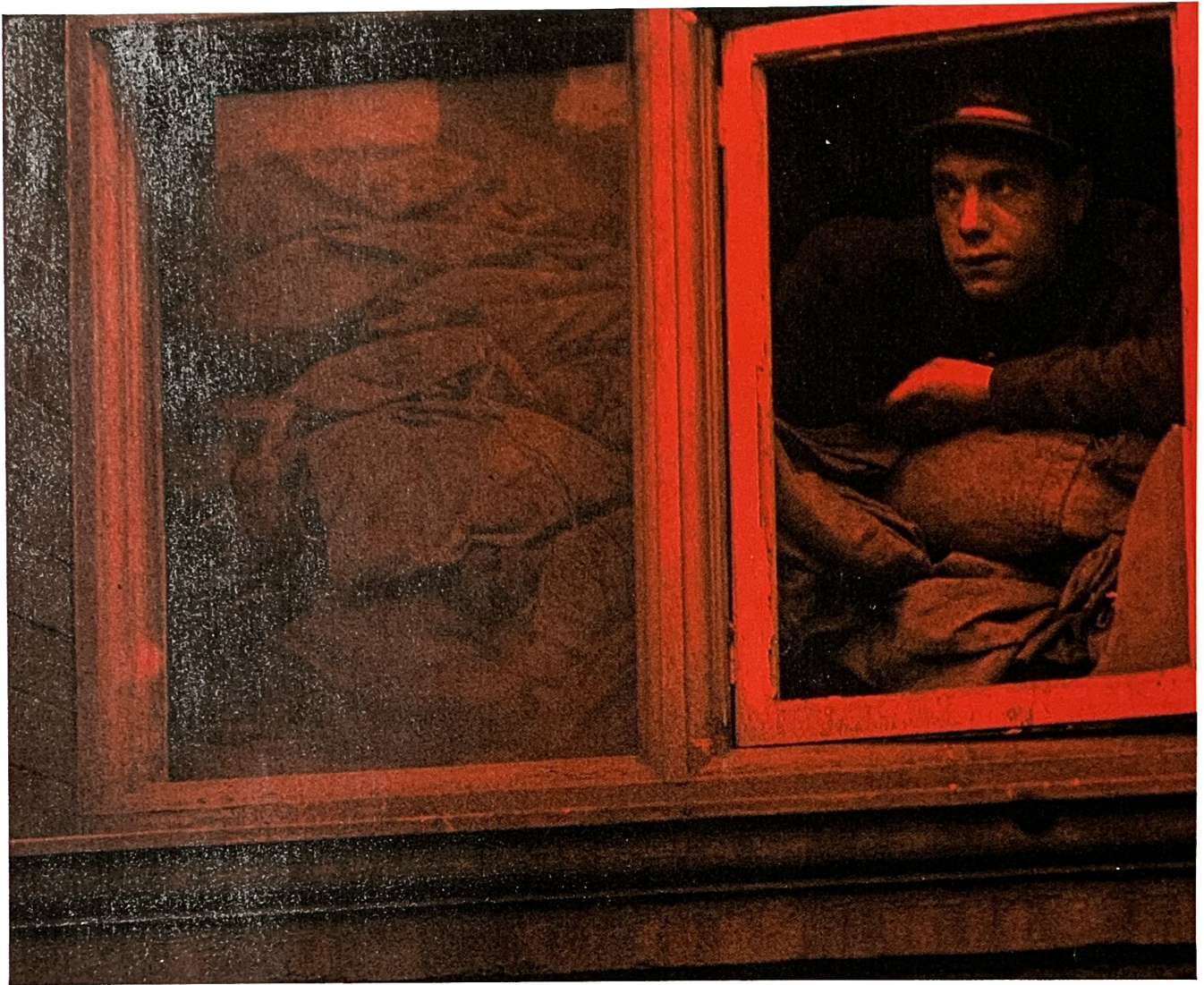
Irish Free State soldier keeping guard over a post office (September 1922).

at his feet. The revolver went off with the concussion and the bullet whizzed past the sniper's head. He was frightened back to his senses by the shock. His nerves steadied. The cloud of fear scattered from his mind and he laughed.